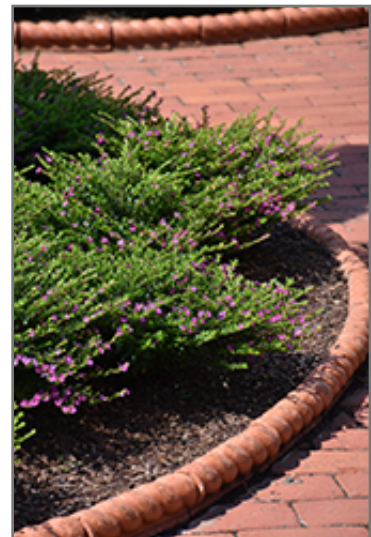
FloriGlory Diana Mexican Heather in bloom