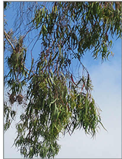
Lemon-scented Gum foliage