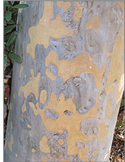
Lemon-scented Gum bark

This tree should only be grown in full sunlight. It prefers dry to average moisture levels with very well-drained soil, and will often die in standing water. It is particular about its soil conditions, with a strong preference for sandy, acidic soils, and is able to handle environmental salt. It is somewhat tolerant of urban pollution. This species is not originally from North America.