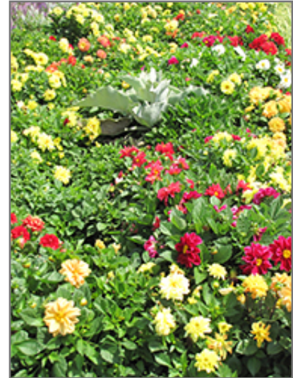
Figaro Mix Dahlia in bloom