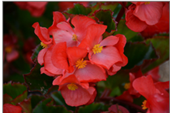
Megawatt Red Green Leaf Begonia flowers