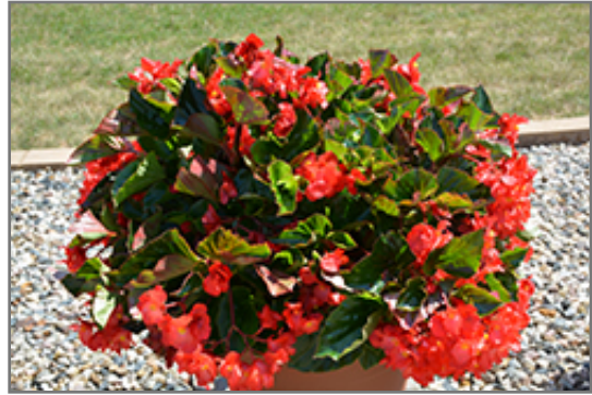
Megawatt Red Green Leaf Begonia in bloom

Megawatt Red Green Leaf Begonia is a fine choice for the garden, but it is also a good selection for planting in outdoor containers and hanging baskets. With its upright habit of growth, it is best suited for use as a 'thriller' in the 'spiller-thriller-filler' container combination; plant it near the center of the pot, surrounded by smaller plants and those that spill over the edges. It is even sizeable enough that it can be grown alone in a suitable container. Note that when growing plants in outdoor containers and baskets, they may require more frequent waterings than they would in the yard or garden.