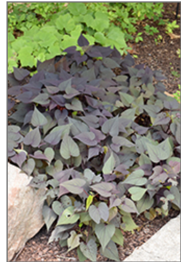
Sweet Georgia Heart Purple Sweet Potato Vine