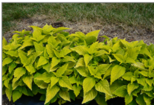
ColorBlaze Lime Time Coleus