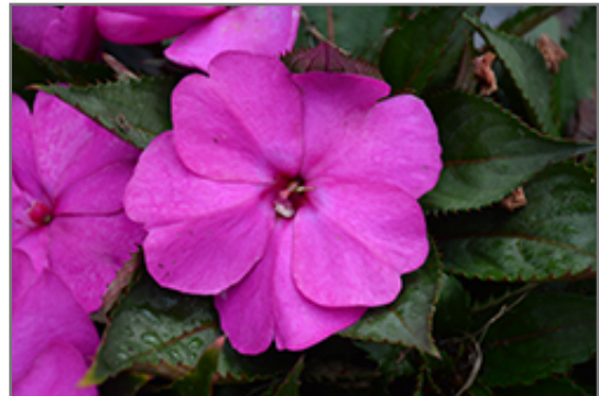
SunPatiens Compact Purple New Guinea Impatiens flowers

This plant will require occasional maintenance and upkeep, and should not require much pruning, except when necessary, such as to remove dieback. It has no significant negative characteristics.