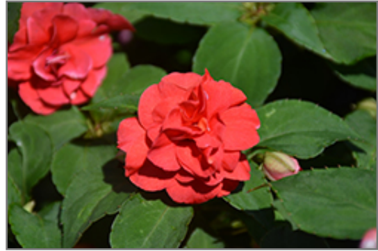
Rockapulco Red Impatiens flowers

Rockapulco Red Impatiens is recommended for the following landscape applications;