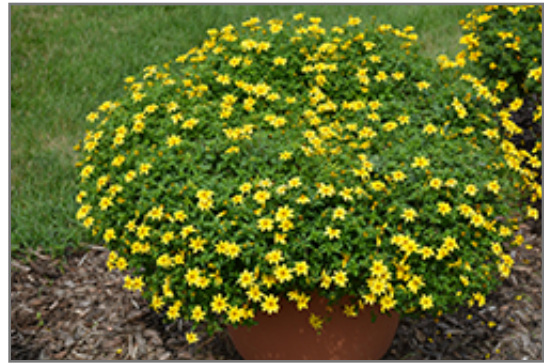
Beedance Yellow Bidens in bloom

Beedance Yellow Bidens is a fine choice for the garden, but it is also a good selection for planting in outdoor pots and containers. It is often used as a 'filler' in the 'spiller-thriller-filler' container combination, providing a mass of flowers against which the thriller plants stand out. Note that when growing plants in outdoor containers and baskets, they may require more frequent waterings than they would in the yard or garden.