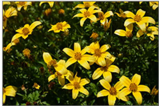
Beedance Yellow Bidens flowers