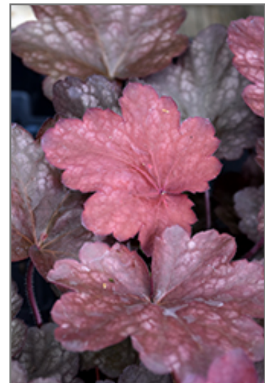
Carnival Candy Apple Coral Bells foliage