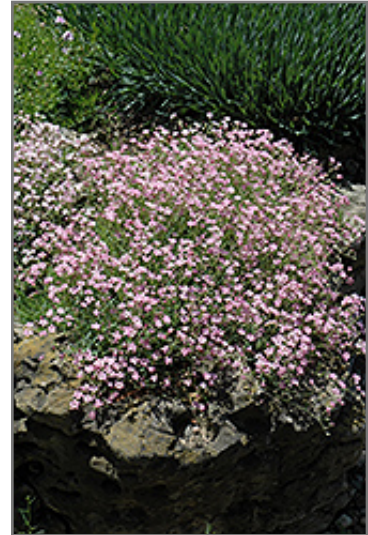
Pink Creeping Baby's Breath in bloom