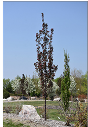
Royal Mist Flowering Crab in bloom