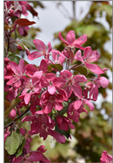
Royal Mist Flowering Crab flowers

Royal Mist Flowering Crab is recommended for the following landscape applications;