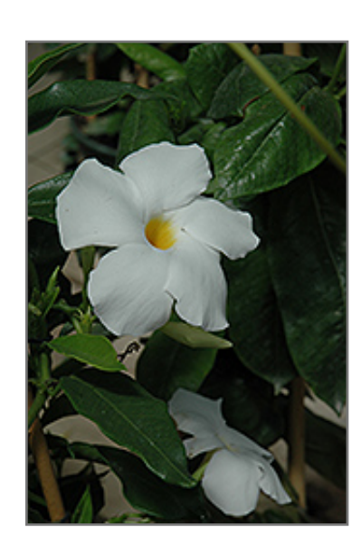
Sun Parasol White Mandevilla flowers

When grown indoors, Sun Parasol White Mandevilla can be expected to grow to be about 10 feet tall at maturity, with a spread of 24 inches. It grows at a medium rate, and under ideal conditions can be expected to live for approximately 20 years. This houseplant will do well in a location that gets either direct or indirect sunlight, although it will usually require a more brightly-lit environment than what artificial indoor lighting alone can provide. It requires an evenly moist well-drained soil for optimal growth. The surface of the soil shouldn't be allowed to dry out completely, and so you should expect to water this plant once and possibly even twice each week. Be aware that your particular watering schedule may vary depending on its location in the room, the pot size, plant size and other conditions; if in doubt, ask one of our experts in the store for advice. It is not particular as to soil type or pH; an average potting soil should work just fine. Be warned that parts of this plant are known to be toxic to humans and animals, so special care should be exercised if growing it around children and pets.