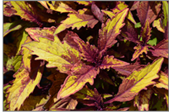
FlameThrower Spiced Curry Coleus foliage

FlameThrower Spiced Curry Coleus is recommended for the following landscape applications;