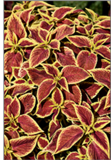
Premium Sun Crimson Gold Coleus foliage

Premium Sun Crimson Gold Coleus is recommended for the following landscape applications;