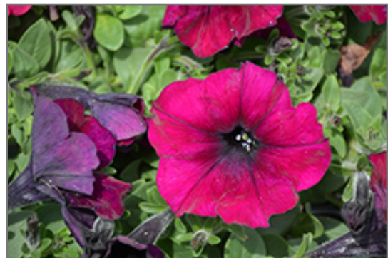
Easy Wave Burgundy Velour Petunia flowers