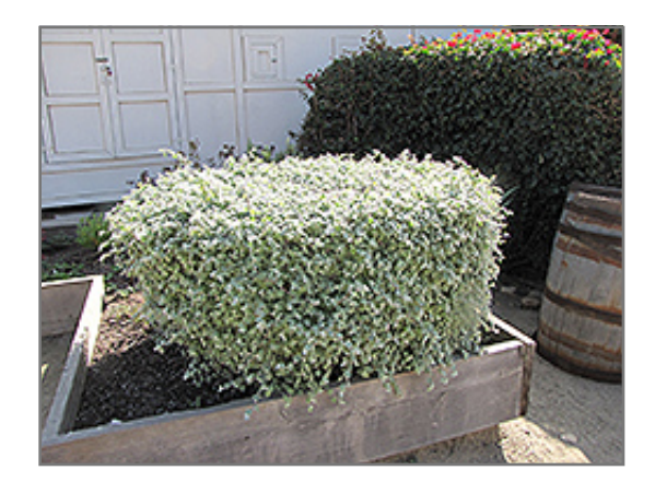
Licorice Plant