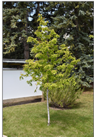
Amur Maple (tree form)