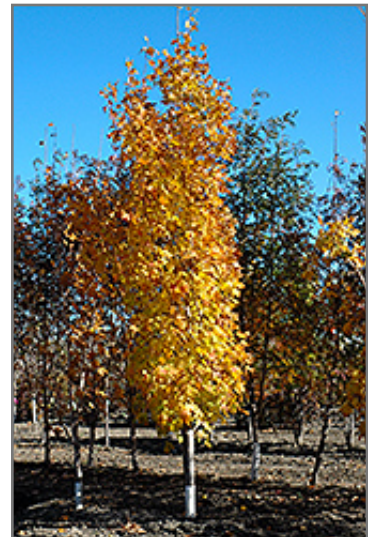
Lord Selkirk Sugar Maple in fall