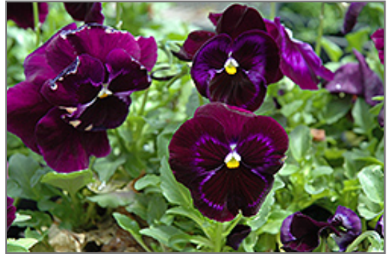
Colossus Neon Violet Pansy flowers

Colossus Neon Violet Pansy is recommended for the following landscape applications;