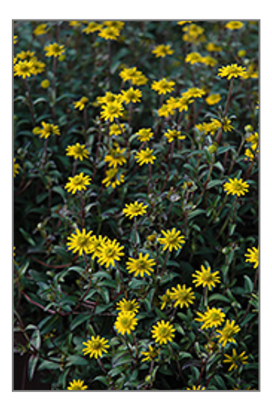
Tsavo Golden Yellow Creeping Zinnia flowers