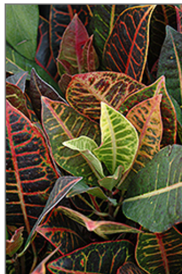
Variegated Croton foliage