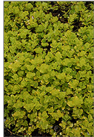
Golden Creeping Jenny foliage

Golden Creeping Jenny is recommended for the following landscape applications;