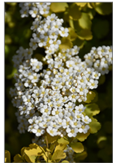
Glow Girl Birch Leaf Spirea flowers