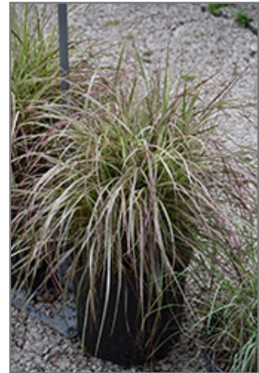
Cherry Sparkler Fountain Grass foliage

* This is a 'special order' plant - contact store for details