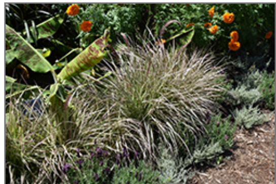
Cherry Sparkler Fountain Grass