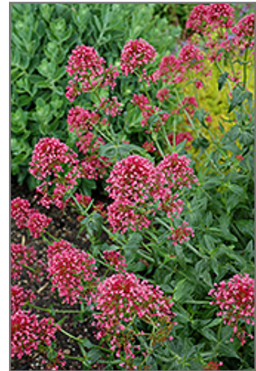
Red Valerian flowers

Red Valerian is recommended for the following landscape applications;