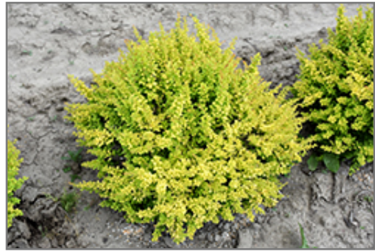
Sunsation Japanese Barberry

Sunsation Japanese Barberry is recommended for the following landscape applications;