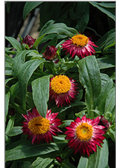
Mohave Dark Red Strawflower flowers