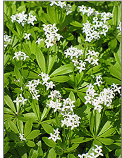
Sweet Woodruff flowers