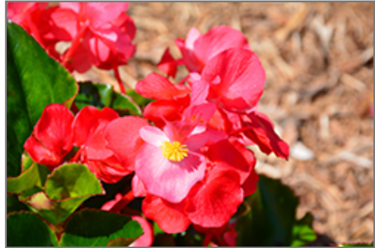
Whopper Rose Green Leaf Begonia flowers

This is a high maintenance plant that will require regular care and upkeep, and usually looks its best without pruning, although it will tolerate pruning. Deer don't particularly care for this plant and will usually leave it alone in favor of tastier treats. Gardeners should be aware of the following characteristic(s) that may warrant special consideration;