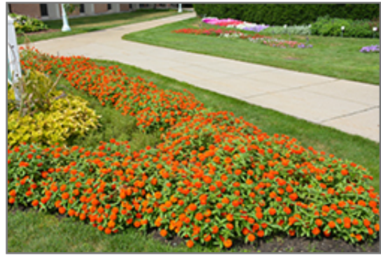
Profusion Double Fire Zinnia in bloom

Profusion Double Fire Zinnia is a fine choice for the garden, but it is also a good selection for planting in outdoor containers and hanging baskets. It is often used as a 'filler' in the 'spiller-thriller-filler' container combination, providing a mass of flowers against which the larger thriller plants stand out. Note that when growing plants in outdoor containers and baskets, they may require more frequent waterings than they would in the yard or garden.