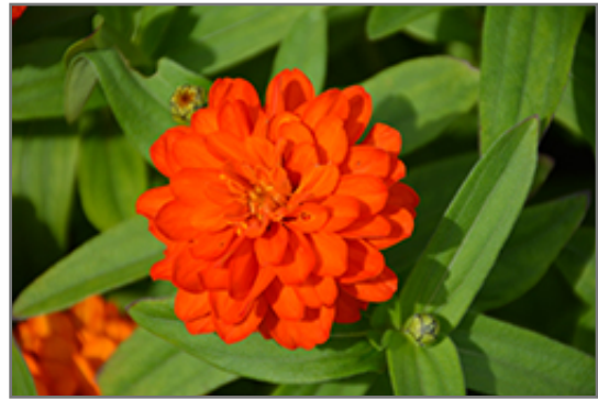
Profusion Double Fire Zinnia flowers