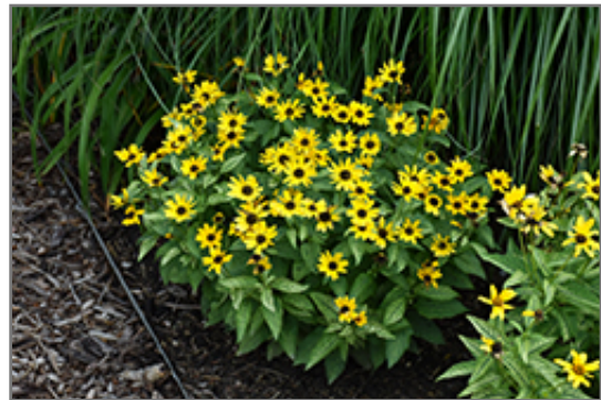
Sunburst False Sunflower in bloom