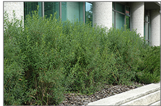
Dwarf Turkestan Burning Bush