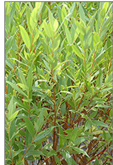
Flame Willow foliage