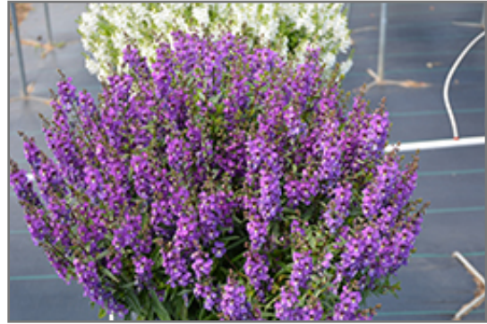
Serenita Purple Angelonia in bloom