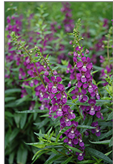
Serenita Purple Angelonia flowers