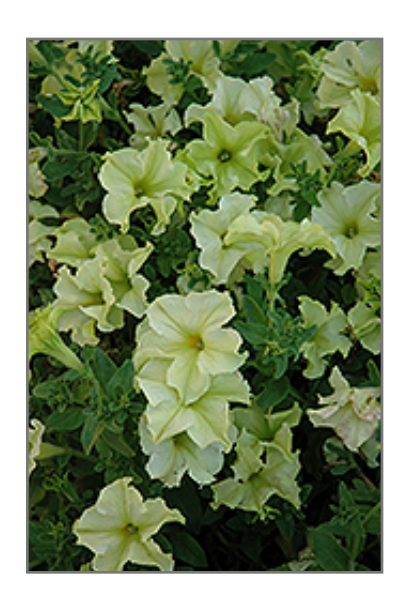
Sophistica Lime Green Petunia flowers

Sophistica Lime Green Petunia will grow to be about 15 inches tall at maturity, with a spread of 14 inches. When grown in masses or used as a bedding plant, individual plants should be spaced approximately 12 inches apart. Its foliage tends to remain dense right to the ground, not requiring facer plants in front. This fast-growing annual will normally live for one full growing season, needing replacement the following year.