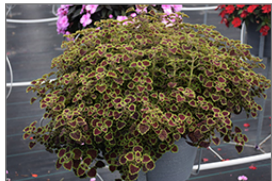
Burgundy Wedding Train Coleus