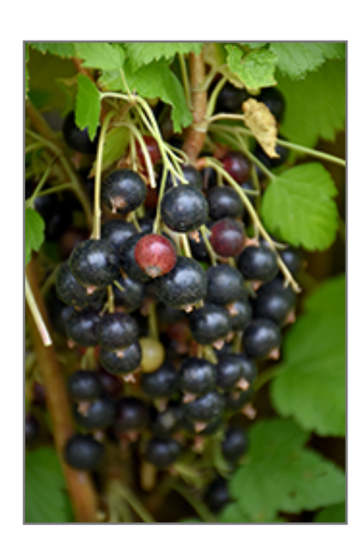
Ben Sarek Black Currant fruit

This is a dense multi-stemmed deciduous shrub with a more or less rounded form. Its relatively fine texture sets it apart from other landscape plants with less refined foliage. This plant will require occasional maintenance and upkeep, and is best pruned in late winter once the threat of extreme cold has passed. It is a good choice for attracting birds to your yard. It has no significant negative characteristics.