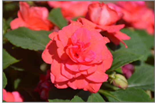
Rockapulco Coral Reef Impatiens flowers

Rockapulco Coral Reef Impatiens is recommended for the following landscape applications;