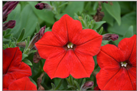
Easy Wave Red Petunia flowers

This plant will require occasional maintenance and upkeep. Trim off the flower heads after they fade and die to encourage more blooms late into the season. It is a good choice for attracting hummingbirds to your yard, but is not particularly attractive to deer who tend to leave it alone in favor of tastier treats. It has no significant negative characteristics.