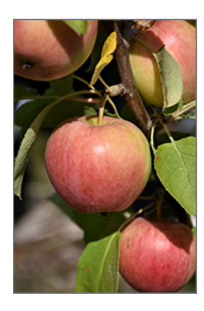
Gemini Apple fruit

This is a deciduous tree with an upright spreading habit of growth. Its average texture blends into the landscape, but can be balanced by one or two finer or coarser trees or shrubs for an effective composition. This is a high maintenance plant that will require regular care and upkeep, and is best pruned in late winter once the threat of extreme cold has passed. Gardeners should be aware of the following characteristic(s) that may warrant special consideration;