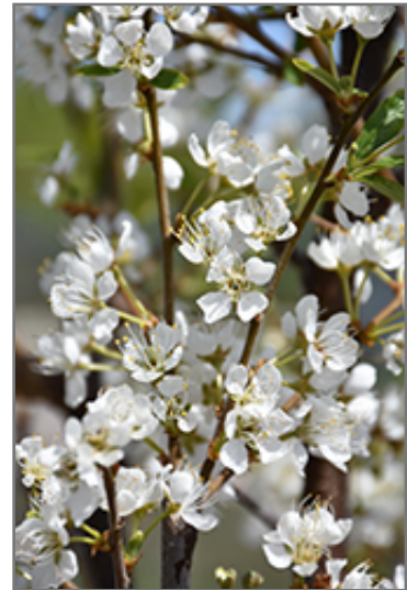
Toka Plum flowers