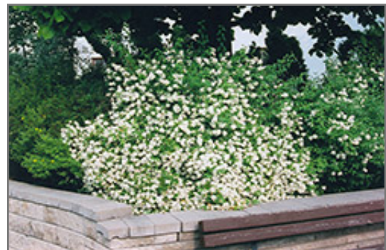
Galahad Mockorange in bloom