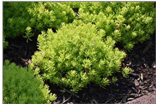
Lemon Coral Stonecrop